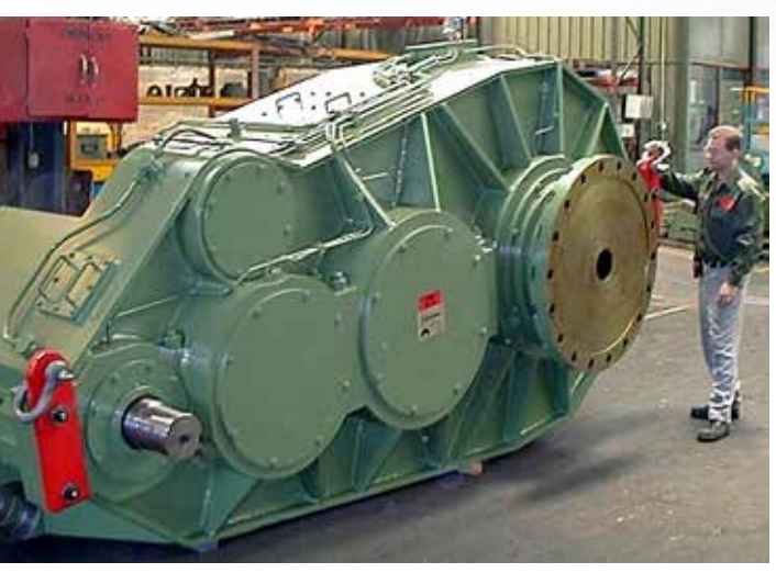
SHAFT MOUNTED ALIGNMENT GEARBOXES