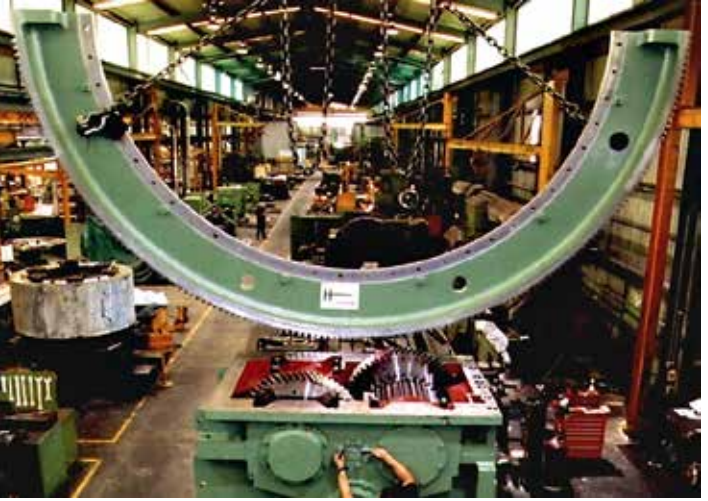
SELF ALIGNING, TWIN PINION MILL DRIVE GEARBOX

©Copyright 2019, Hofmann Engineering Pty Ltd.