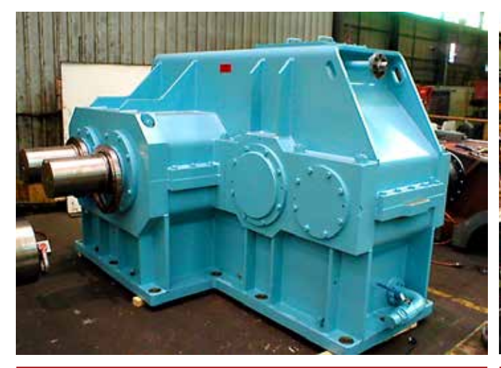
DOUBLE OUTPUT EXTRUDER GEARBOX